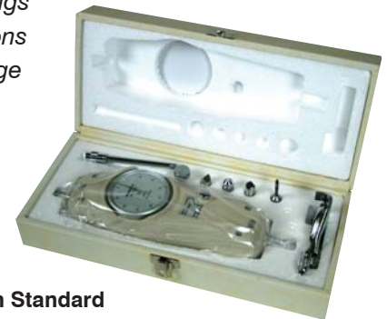
MF in Standard Carrying Case