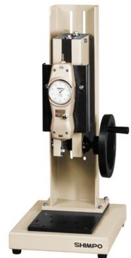
MF with FGS-100H Manually Operated Test Stand (sold separately)