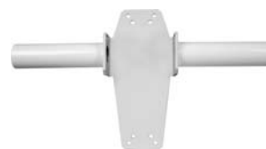
Optional MFP-Handle Ideal for Heavy Loads

*Note: Additional accessory adapters available. Please contact the factory.